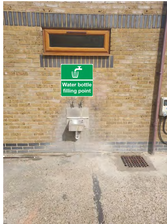
Location 7: Boatyard Water filling