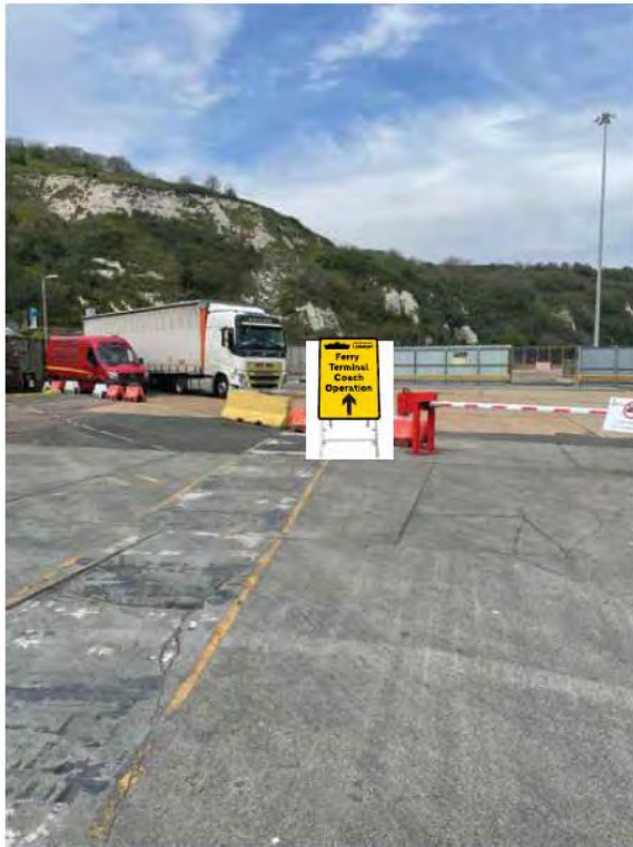
Location 6: DVSA Car Parking