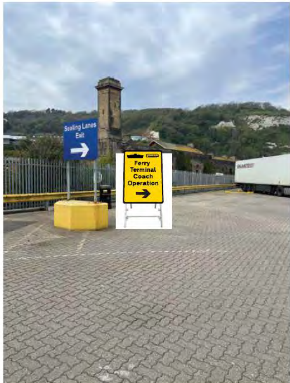
Location 5: Motis Yard