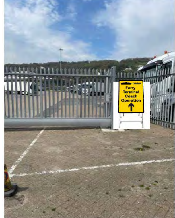
Location 4: Exit Pink Car Park