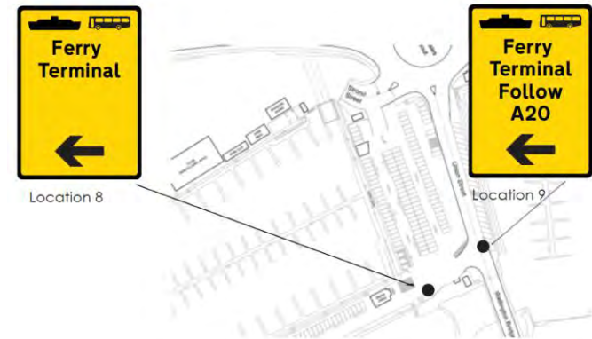
Location 8&9: Union Street Car Parking