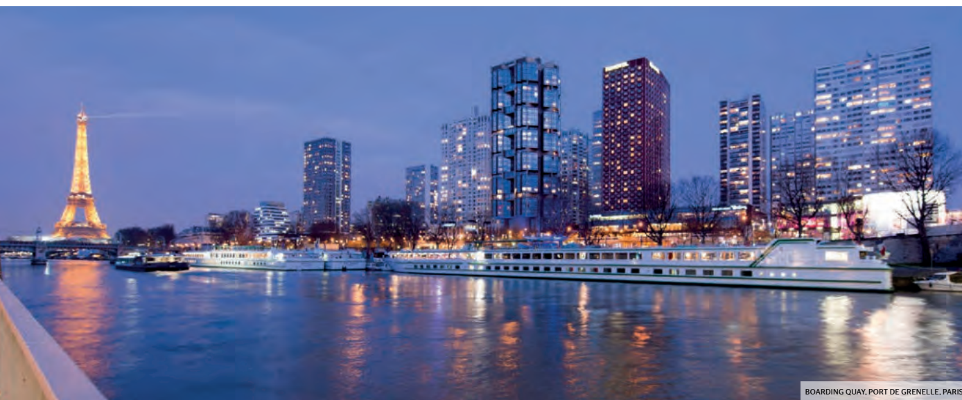
BOARDING QUAY, PORT DE GRENNELLE, PARIS